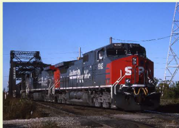
SP 8145 West at Nerska (Chicago), Illinois on October 10, 1994.

The reunion will be held at the DESERT DIAMOND RESORT ( http://ddcaz.com/tucson/ ) in Tucson from April 24, 2022 through April 27, 2022 (with checkout on April 28, 2022). Rates for the rooms will be $99.00 per night, plus 12.5% tax and $2.00 per day occupancy tax. Included are a $10.00 per room food credit for each night and can be redeemed at any of the dining outlets at the hotel or casino; transportation to and from the airport; transportation to and from the Arizona Sonora Desert Museum (the cost to tour the museum is $14.99 per person); access to the Business Center; complimentary wireless internet access; cable TV, and concierge services.