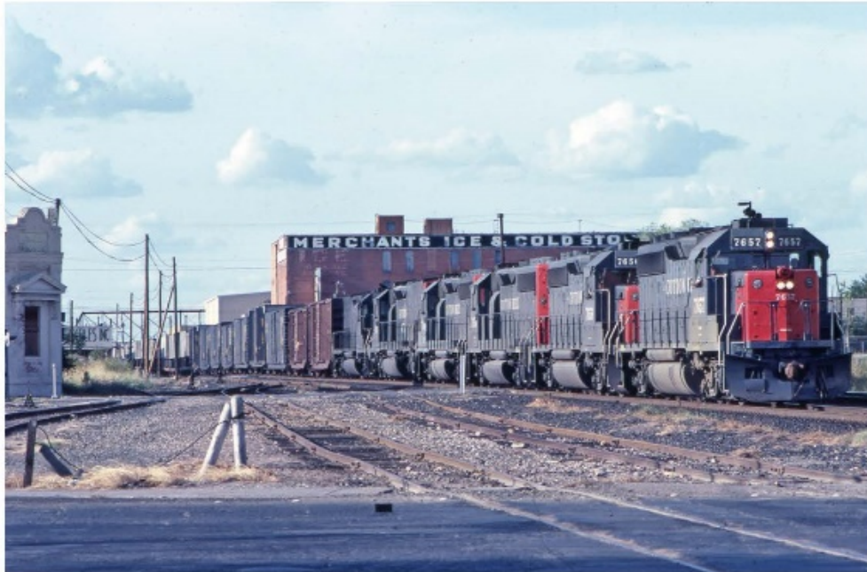
SSW 7657 West, MBSMF, traveling through San Antonio on August 28, 1982.

Saturday, November 13, 2021 10:30 am – 6:00 pm Raymond Russell Park 20644 IH-10 W San Antonio, Texas Pre-lunch snacks and lunch provided BYOB and bring your favorite dessert if you'd like