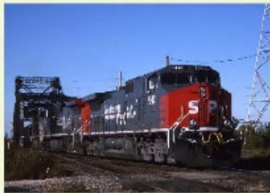
SP 8145 West at Nerska (Chicago), Illinois on October 10, 1994.

The reunion will be held at the DESERT DIAMOND RESORT ( http://ddcaz.com/tucson/ ) in Tucson from April 24, 2022 through April 27, 2022 (with checkout on April 28, 2022). Rates for the rooms will be $99.00 per night, plus 12.5% tax and $2.00 per day occupancy tax. Included are a $10.00 per room food credit for each night and can be redeemed at any of the dining outlets at the hotel or casino; transportation to and from the airport; transportation to and from the Arizona Sonora Desert Museum (the cost to tour the museum is $14.99 per person); access to the Business Center; complimentary wireless internet access; cable TV, and concierge services.